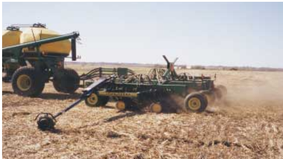
The 1850 drill leaves the stubble mostly intact.

Despite doing all their own planting, spraying, fertilizing, and harvesting (except cotton), plus tending the cattle and handling seed, they have