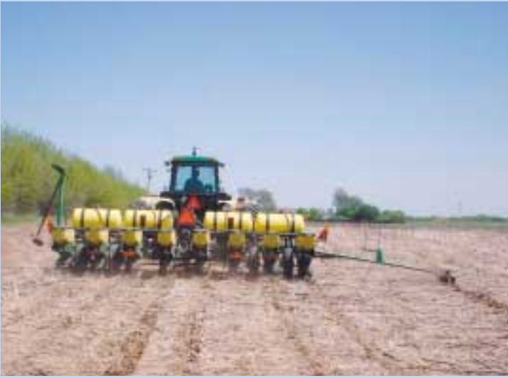
Joe Swanson planting corn into wheat/dc 'flower stubble.

stant, like an addict's strong cravings while trying to kick the habit.