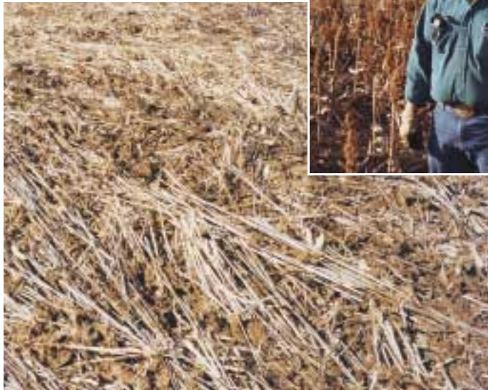
Tony strives to keep the soil covered with plenty of crop residue.

also fertilized differently. All the wheat gets a 12-30-20 blend of dry fertilizer applied in-furrow at planting. The intensively managed wheat receives no further N until mid-January when it gets a shot applied as a UAN stream with Kodeshes’ RoGator—they always stream the UAN rather than spraying it, due to potential for increased N losses and residue tie-up with sprayed UAN. The second shot of UAN is applied at first joint, about mid-March, again as a stream. Any foliar fungicides, insecticides, or herbicides are applied in separate passes. Although Tony has applied foliar fungicides 4 out of the last 5 years, and sees the yield responses to justify doing so, he also notes that the rotations have