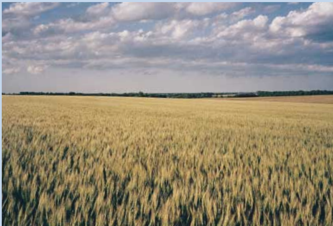
The U.S. Plains wasn't always monoculture wheat. What have we lost along with the crop diversity?

being a C3 plant with a maximal photosynthetic rate occurring at about 50°F (10°C). Wheat varieties grown in the Pacific NW, or in England, or in Australia, all have genetics that take advantage of the very mild winter and slow warm-up in those regions, which allows the plant to do grain filling over a very long time, to produce and finish a huge number of tillers per plant before it gets hot. Many of those areas produce very high yields of wheat (easily 100 to 150 bu/a) and other winter cereals 2 . Needless to say, the varieties grown in those areas would fare poorly in Kansas. In addition to growth habits, there is also a wide variety of grain characters amongst wheats, including not only the soft and hard reds with